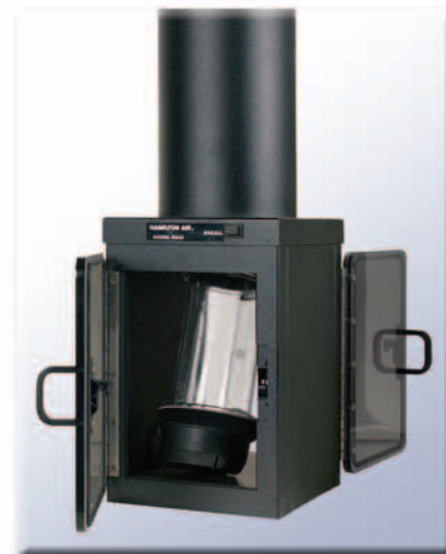
Double-Sided Overhead Teller Unit ...provides easy access to carrier from either side of a teller counter