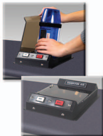
Through-the-counter Teller Unit ... low profile unit provides access from both sides of the counter