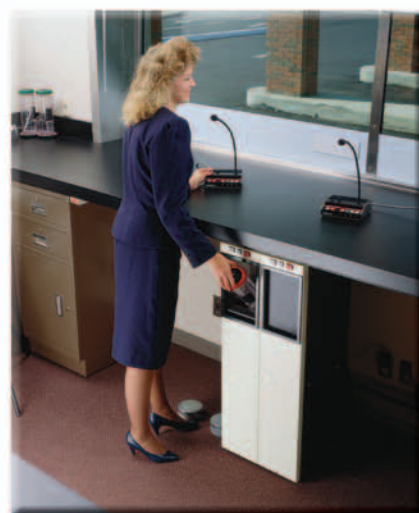
HA-1000-Downsend ...affords unrestricted visibility over the teller counter