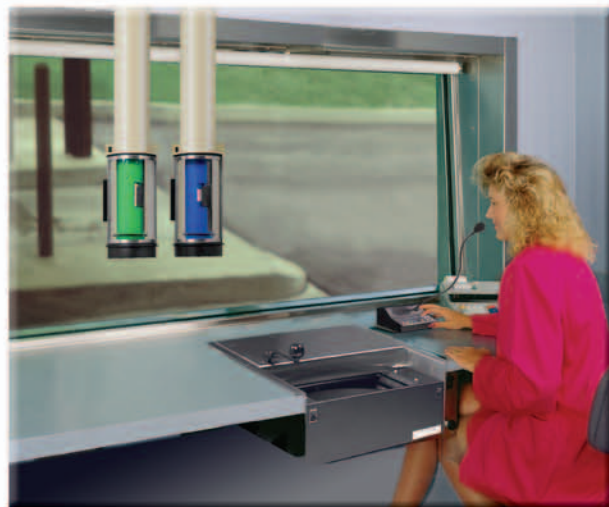
Upsend Teller Unit ...quiet, simple operation