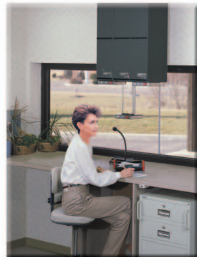
Motorized Teller Unit ... carrier landing platform withdraws, out of teller's line of sight