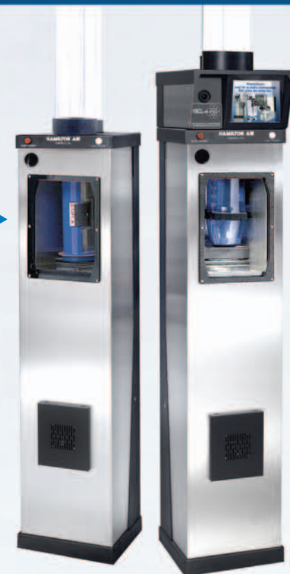
The Hamilton HA-45 is available as an upsend unit only.