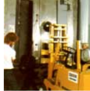
Following completion of the vault itself, technicians install a Hamilton vault door before final finishing operations.