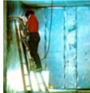
Second vault consists of panels moved from an across-town installation. Panels may be welded or bolted together as required.