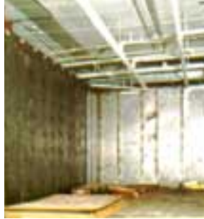
In this second-story, two-vault, Class II installation, the first vault (at left) is complete. Floor and back wall of second vault are under construction.

Your Hamilton professional is an independent businessperson with a vested interest in your community and in making sure you are a satisfied customer. Installation crews and service technicians are always local representatives, friendly and quick to respond. Consult with a Hamilton professional about all your security needs.